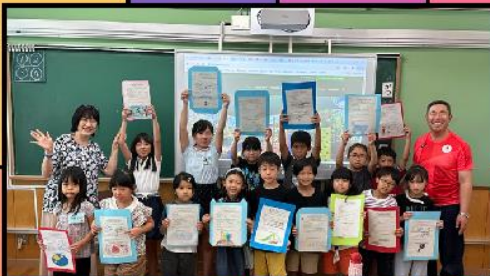
THE SUMMER CLIL PROGRAM PARTICIPANTS FROM MAGOME ELEMENTARY SCHOOL