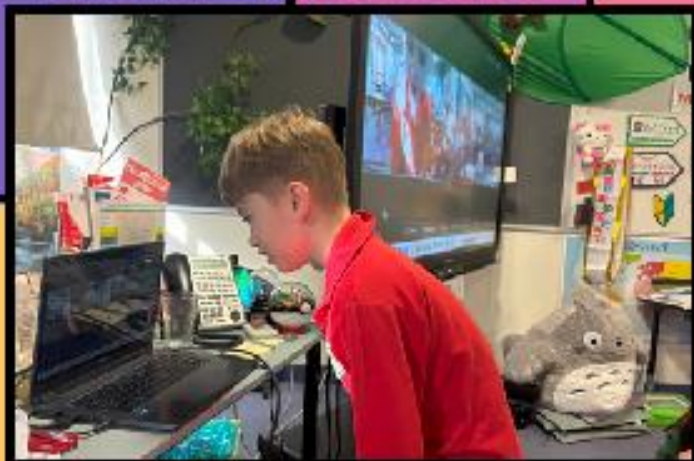
PRACTISING JAPANESE 'ROCK-PAPER-SCISSORS'