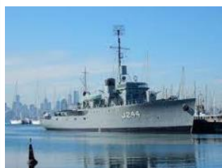
HMAS Castlemaine Service at The Shrine Grade 6