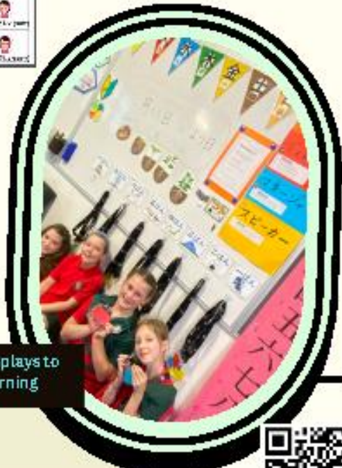
Bilingual displays to support learning