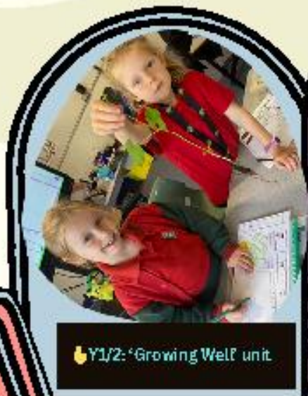
Y1/2: 'Growing Well' unit