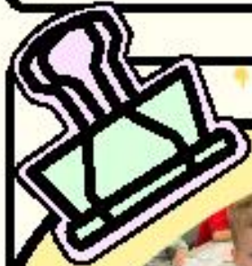
Foundation: Sound Experiment

Welcome to our 'Japanese CLIL Science' room! This unique blend of Science and Japanese learning through Content and Language Integrated Learning (CLIL) is an innovative approach that promotes bilingualism, critical thinking, and a global perspective. While the term 'CLIL' is relatively modern, dating back to 1994 in Finland, the concept itself has roots tracing back to the 1960s. This method goes beyond traditional subject teaching by immersing students in the language (Japanese) to facilitate learning and using language skills to explore scientific content. By integrating Science and Japanese, students not only deepen their understanding of scientific concepts but also enhance their language proficiency. Let's step into our CLIL room and see how students are enjoying the lessons!