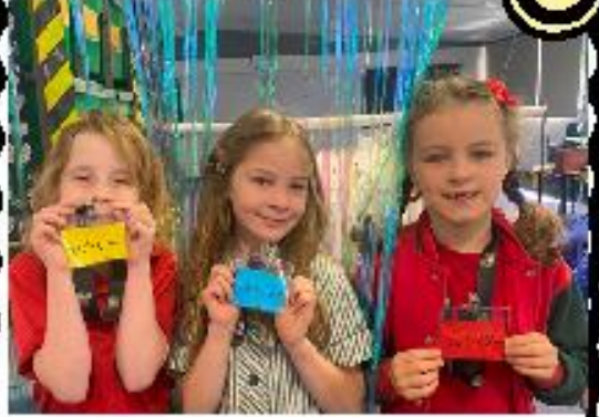
Y3/4s 'Pickler' for reflection

Each team rotates roles every week - Speaker, Manager and Director