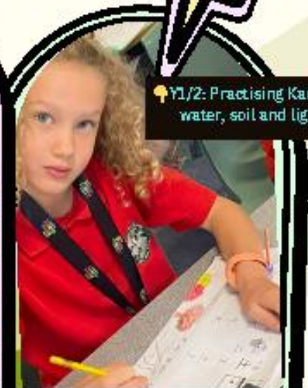
Y1/2: Practising Kanji for water, soil and light