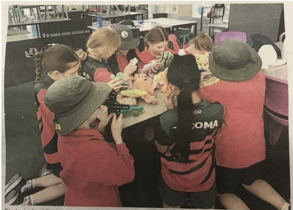
Students from Tecoma Primary School have created postcards to be sent overseas as part of the campaign.

We look forward to continuing our association with ACAN next year.