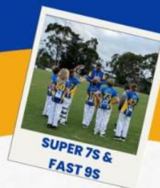
SUPER 7s & FAST 9s